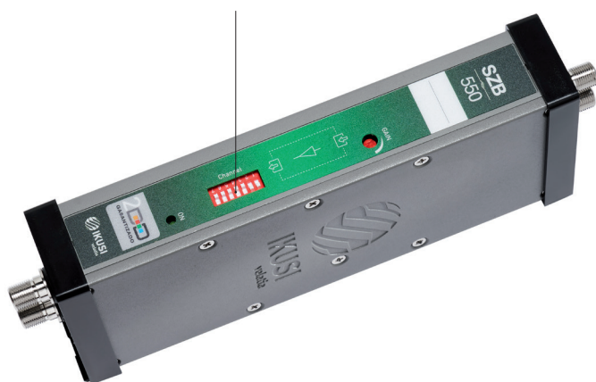
Comparison of selectivity between Ikusi SZB+550 amplifier and others on the market